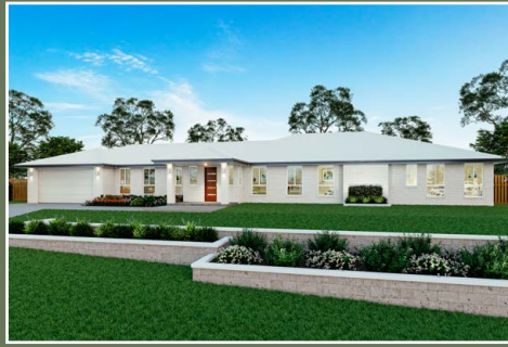
ARCADIA 42 – CENTRAL FACADE