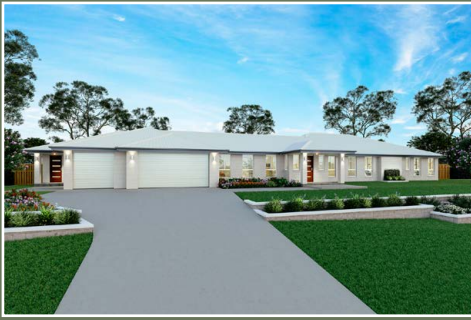
ARCADIA 42 GRANDE – CENTRAL FACADE